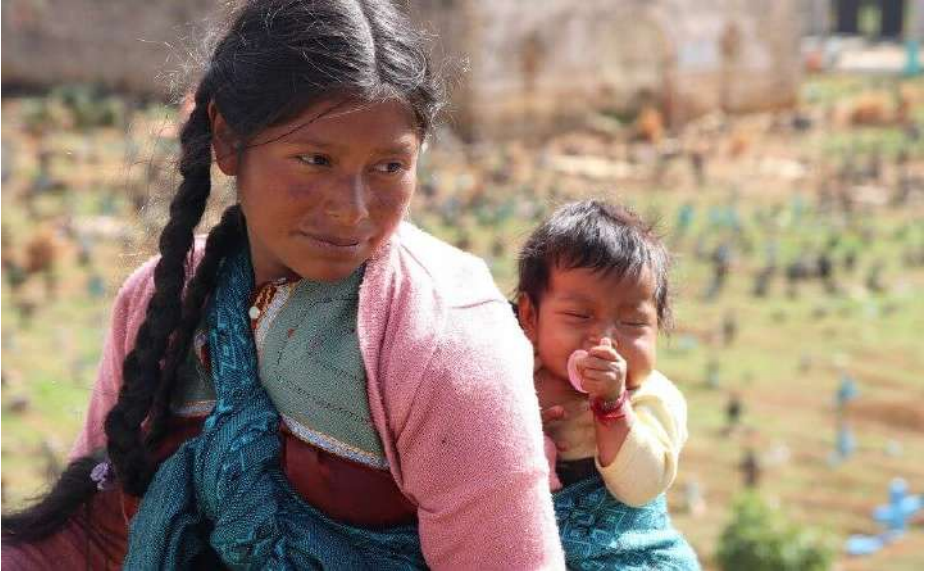
Corruption deprives the vulnerable of an opportunity to lead dignified lives.

It's time to uncover the true impact of corruption on our economic, social, and political landscapes. Brace yourselves: we will open our eyes to the devastating consequences corruption leaves in its wake.