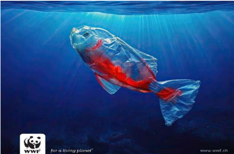
Image: Midjourney generated artwork by German Kopytkov for wwf. “Marine Metamorphosis.” This project focuses on the concerning prediction that, by 2050, plastic in the ocean will outweigh fish if we don't take effective measures to reduce plastic pollution.