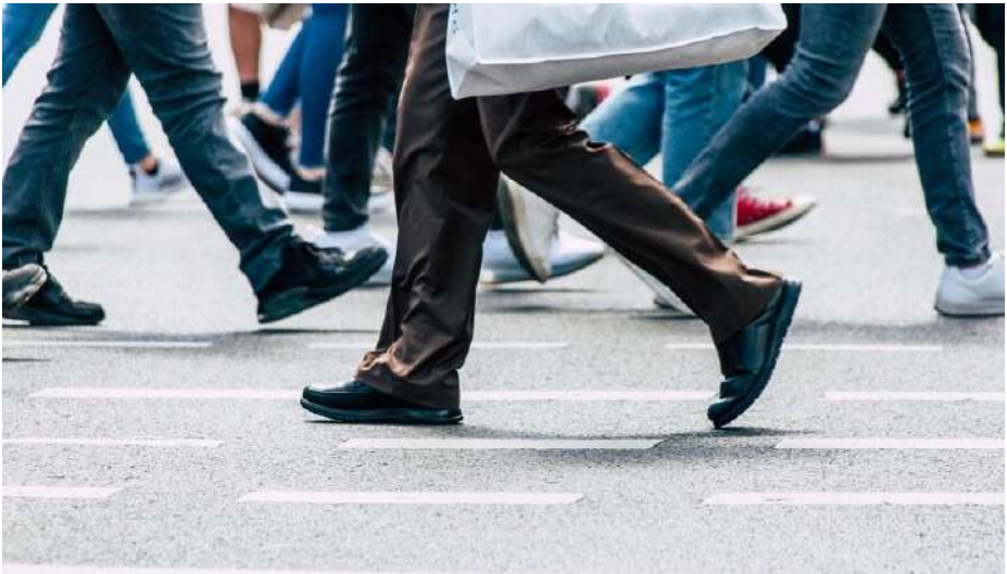
(pedestrian-8037900)

Together, we can create a world where corruption has no place, education flourishes, and AI is harnessed for the greater good. So, let's embrace the challenge, stand as champions of transparency, and build a future that we can all be proud of.